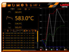
The Table View showing Instantaneous, Valley, Average and Peak, plus the unique Meltmaster temperature (on the 055 L model) readings.

The Trend View displays Peak, Instantaneous, Average and Valley temperatures, Logger settings, Route Manager, Background Correction plus Timed Logging (taking measurements at pre-defined intervals between 1 and 60 secs).